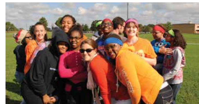
Secondary students experience team building at Richmond Ropes.