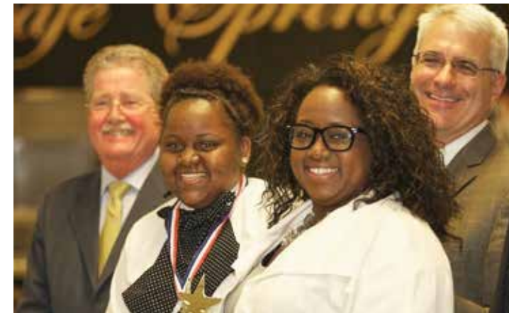
Celebrating with G4G students