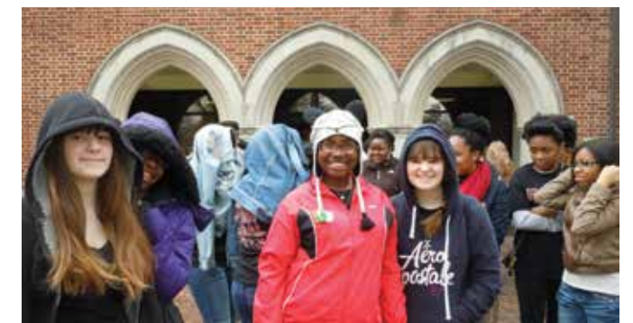
Eighth graders tour University of Richmond.