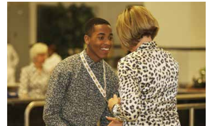
A senior receives his medal.