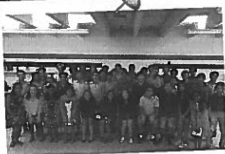
Personal Project Showcase