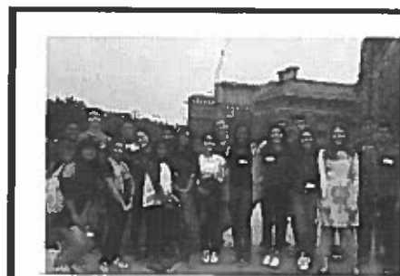
IB students visit VCU for a STEM workshop.