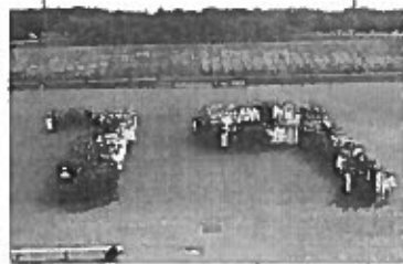
Class of 2019