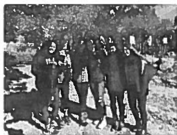
Group IV Project at Belle Isle

It's been chilly outside but inside the classroom things are heating up. The IB seniors have been busy with college essays and applications and are patiently awaiting news. Our DP juniors have traveled to the VCU library for extended essay research and conducted an interdisciplinary science experiment at Belle Isle. The sophomores turned in their Personal Projects, the culminating project of the MYP, and celebrated with cupcakes. The newest IB Tigers, Class of 2022, have gotten off to a great start. They have been busy joining clubs, trying out for sports, brainstorming CAS experiences, performing in band, orchestra and chorus and rehearsing for the winter musical.