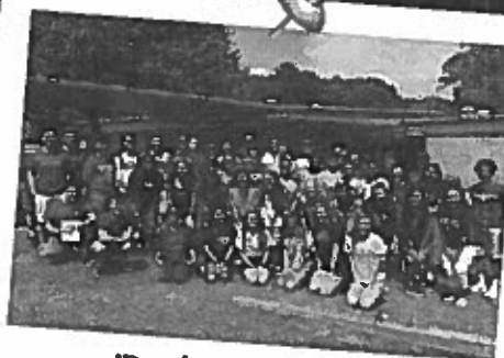
IB Class of 2019